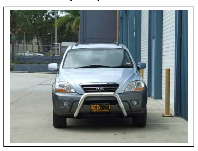
Figure 11: 76mm Nudge Bar, Front view shown, later shape bumper shown