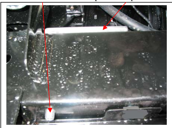
Figure 4 – Passenger side shown

3/8 x 6 bolt Steel plate on top of chassis