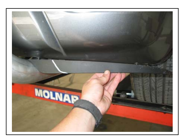
Figure 7: Chin spoiler trim, passenger side shown

29 Snook St Clontarf QLD 4019 Australia Po Box 122 Margate QLD 4019 Australia