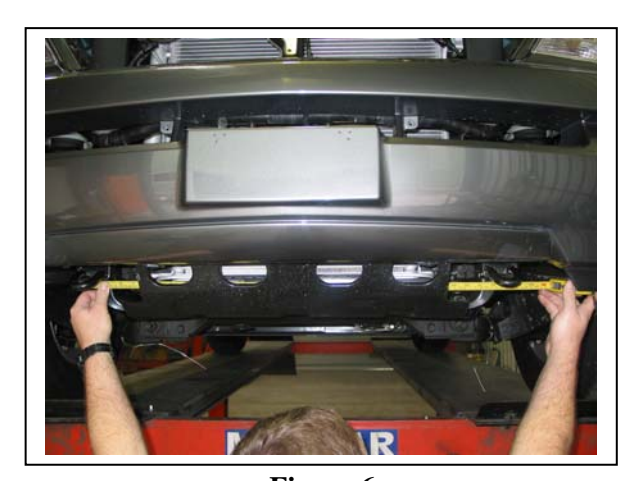
Figure 6 Checking steel angle mounts distance apart