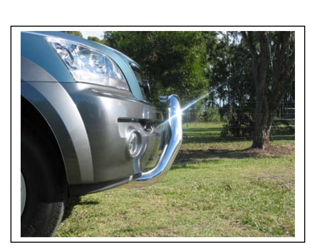
Figure 9 : 76mm Nudge Bar, side view, Early shape bumper shown