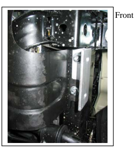
Figure 5 Passenger side looking

Tie plastic inner guard back with wire or similar to create access